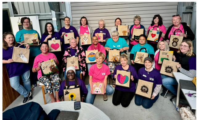
Aylesbury 2nds Together Day Retreat