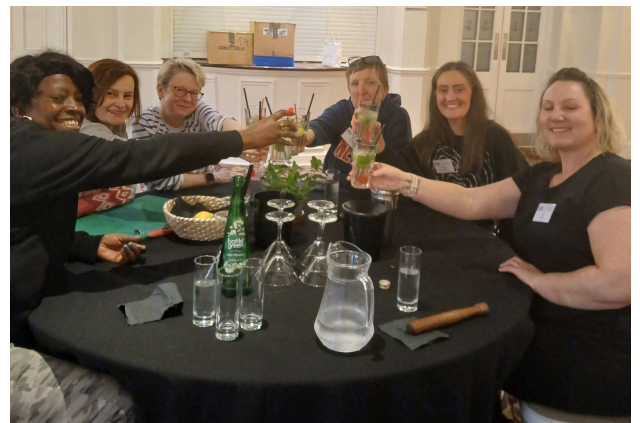
Whitstable 2nds Together Retreat