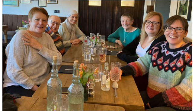
Hereford Tea & Chat

October was busy with our Metastatic Breast Cancer Awareness Day events with an afternoon tea at Tigerlilly, Edinburgh, and our annual joint event with Future Dreams charity, Secondary Sisters and InsuranceWith in London. We also helped to host an afternoon at Jennifer Young headquarters in Crewe. These events are really important as Breast Cancer Awareness Month can be incredibly emotional for the community so it gives a chance for people to come together and support each other.