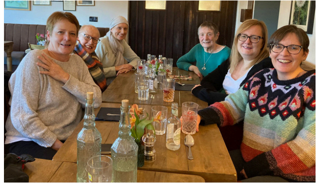
Hereford Tea & Chat

October was busy with our Metastatic Breast Cancer Awareness Day events with an afternoon tea at Tigerlilly, Edinburgh, and our annual joint event with Future Dreams charity, Secondary Sisters and InsuranceWith in London. We also helped to host an afternoon at Jennifer Young headquarters in Crewe. These events are really important as Breast Cancer Awareness Month can be incredibly emotional for the community so it gives a chance for people to come together and support each other.