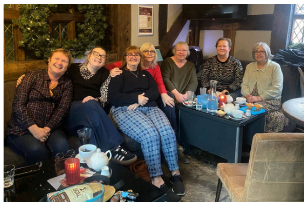
Nantwich Tea & Chat