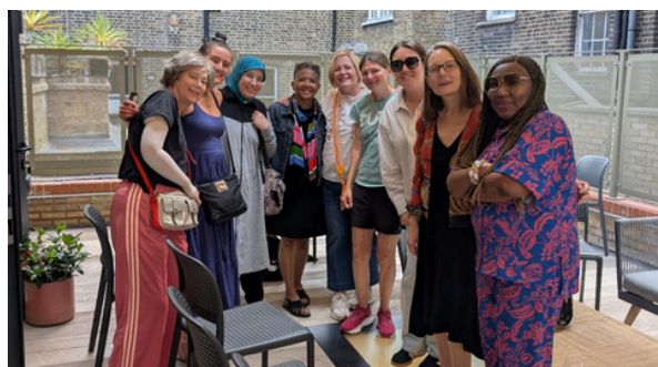
London Tea & Chat